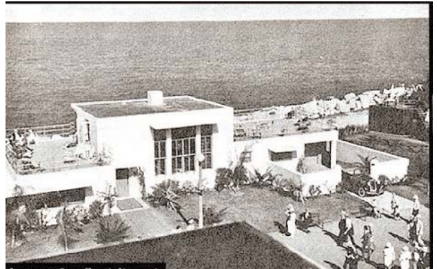
The Florida House