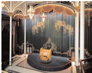
The Music Room

We are going to explore the opulence of the astonishing multi-million dollar Sanfilippo Mansion in Barrington with a guided tour.